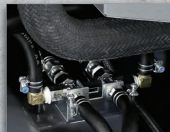
9 | External Fuel Tank Connections with 3-Way Selection Valve

BEST-IN-CLASS dBA RATING // 24-HOUR RUNTIME // EXCELLENT MOTOR STARTING THE INDUSTRY'S HIGHEST-QUALITY MOBILE GENERATORS