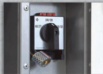
7 | Lockable Voltage Selector Switch 3Φ 277/480V & 139/240V-120/208V 1Φ 120/240V