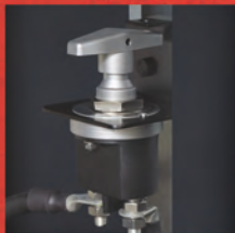
Lock. Battery Disconnect