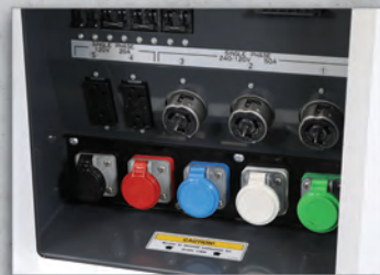
2 | Single-Phase Receptacles 120V - 20A x 2 | 240V - 50A x 3 Optional Single Row Cam-Loks™ Shown