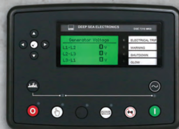
1 | DSEgenset® Digital Control Panel Model 7310 MKII